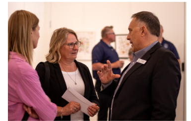
Grant Recipients, 2024