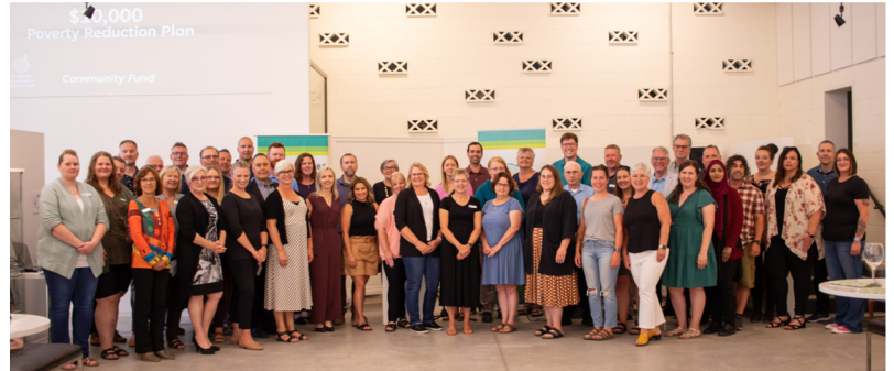
2024 Grant Recipient Presentation

https://winklercommunityfoundation.com/grants/