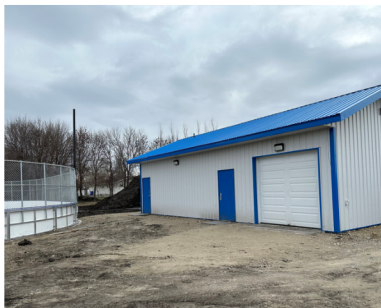
Reinfeld Park, grant