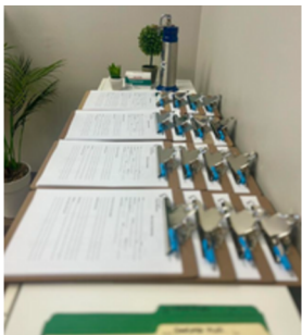
South Central Cancer Care, grant