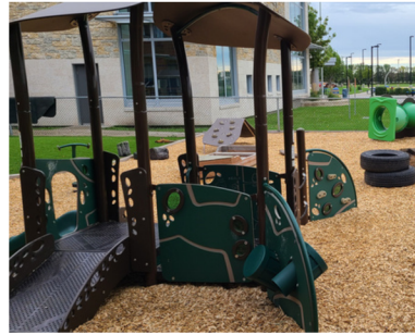
Northland Childcare centre, grant