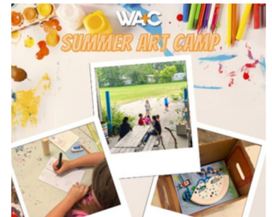
Winkler Arts & Culture, grant

We are celebrating one year at our new office: 2-880L 15th Street, Winkler