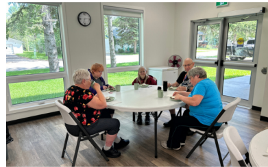
Gateway Resources, grant